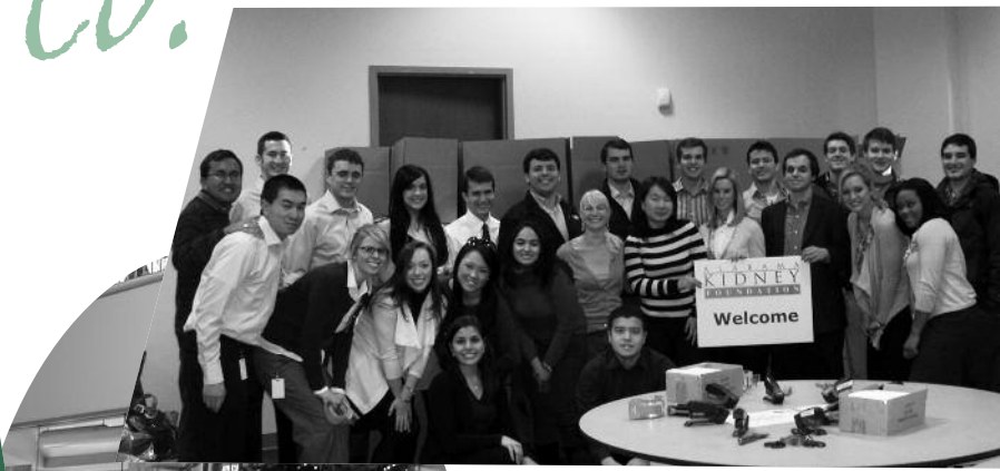
BBVA Compass Volunteers